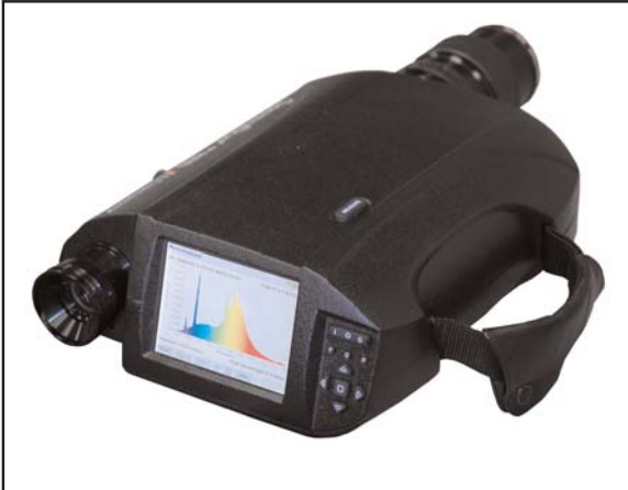
PR-655 SpectraScan Colorimeter

For nearly 15 years, the PR-650 SpectraScan has been the most widely used spectroradiometer in the world - the workhorse of the industry. The new PR-655 replaces the world renowned PR-650 with a plethora of enhancements. This unique, portable battery powered instrument utilizes a fast-scanning 128 detector element spectrometer with a spectral resolution of 3.12 nm per pixel and is supplied with an automated measure shutter. A 1° measuring field is standard equipment with the PR-655 - a 1/2° aperture can be ordered as an option. Other hardware features include AutoSync ® for automatically synchronizing to the source refresh rate insuring the utmost accuracy, an external trigger port allowing remote measurement activation from either a push button or peripheral device, a Secure Digital (SD) port for measurement storage, and a long lasting rechargeable Lithium-ion (Li) battery.